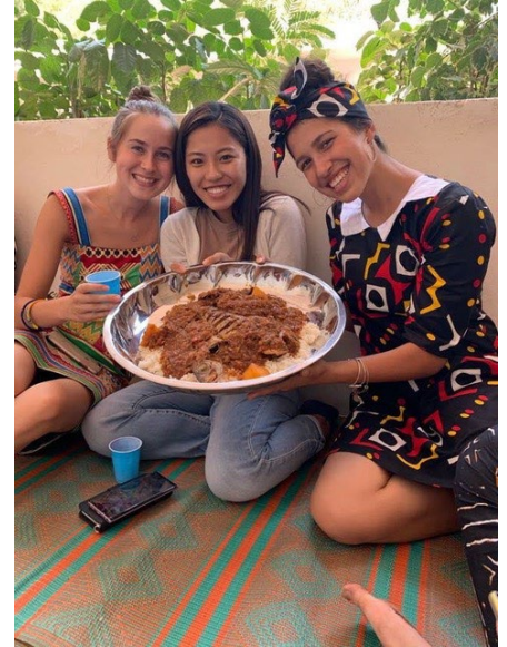
A PICS student while studying abroad in Dakar.

ECON 451: Intermediate Introduction to Statistics and Econometrics