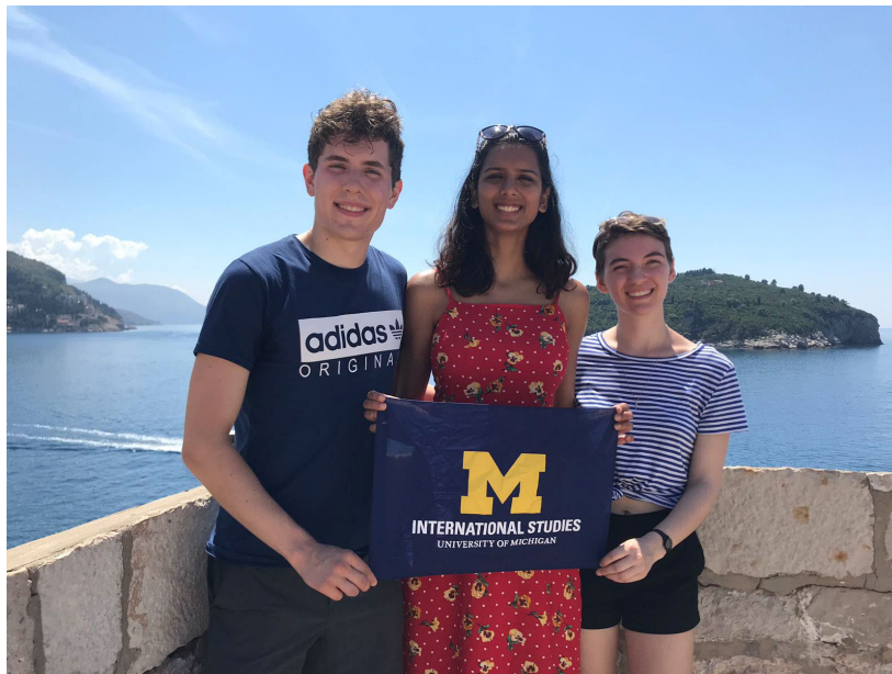
International Studies student on a study abroad experience in Albania.

PICS also administers the Arctic Internship Fellowship which is open to all University of Michigan undergraduate students, and the International Human Rights Fellowship which is specifically open to all LSA undergraduate students. PICS keeps track of other various internship, research, and funding opportunities in and related to international issues on the PICS announcement blog . PICS is also a part of the International Institute which provides several additional funding opportunities to undergraduate students, including those from the Donia Human Rights Center .