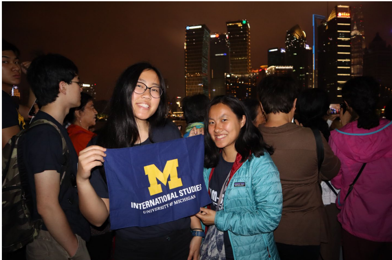
International Studies students on a study abroad experience in China.

*Please note that one shared course can count for both Geographic and Thematic Emphasis in the minor.