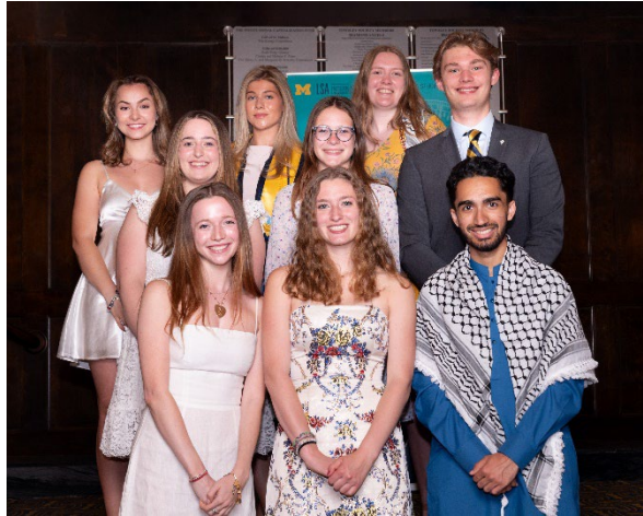
2024 International Studies Honors Plan student cohort at the PICS Graduation Ceremony.

The Program in International and Comparative Studies (PICS) offers an Honors Plan for International Studies majors with an overall GPA of 3.4 and with a grade of B+ or better in INTLSTD 101. Students elect INTLSTD 498 in the fall and INTLSTD 499 in the winter (the senior Honors proseminars) during their senior year and write a major research paper under the direction of a faculty advisor and the instructor of INTLSTD 498-499.