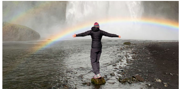
International Studies student on a PICS funded internship in the Arctic.

International studies advisors are available to meet with undeclared students who would like to learn more about the program, and also with current majors and minors who would like to discuss course selection, major or minor requirements, senior releases, and other matters of concern. Advising appointments are available In Person, Phone, and/or Virtual formats. Please make your advising appointment by using the online advising appointment system .