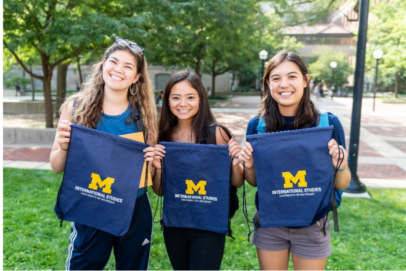
International Studies students at the fall Welcome Back PICS Students event.

Please note that only the PICS director can approve courses used towards the sub-plan requirement that are not already found on the pre-approved list. Students sometimes find courses that are suitable for their programs and can petition to have them approved by filling out the online PICS Course Approval Form . (Login with Kerberos username and password).