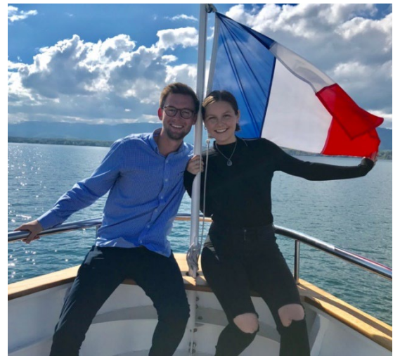
Above: International Studies students studying abroad in France. Left: International Studies student studying abroad in London.