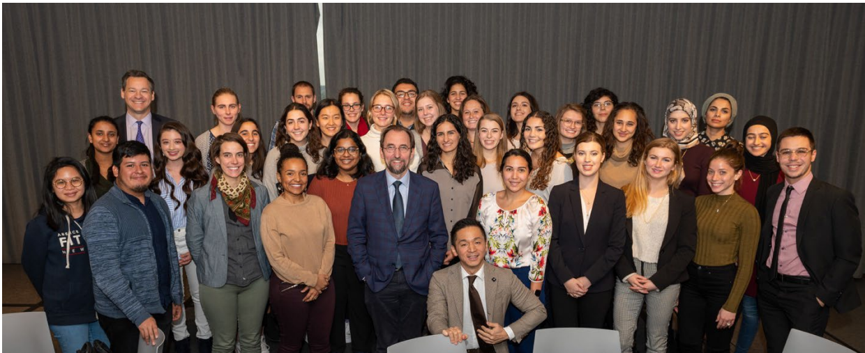
International Studies students and Public Policy students with United Nations High Commissioner for Human Rights (2014-18) Zeid Ra'ad Al Hussein

A: The only restriction is that you may not apply 100-level courses toward the satisfaction of your elective requirements.