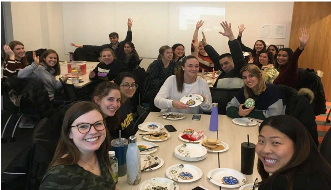
2019-2020 Sigma Iota Rho members at a meeting with cookie decorating.

Although studying abroad is not mandatory, it is highly encouraged. A cross-cultural experience broadens your perspective and helps you develop skills that are sought out by future employers. Students should visit the Center for Global and Intercultural Studies (CGIS) , U-M's study abroad office, to learn more about study abroad program opportunities. PICS offers some limited funding to International Studies majors that study, intern, or conduct research abroad. For more information about this please go to Funding Opportunities, pg. 16.