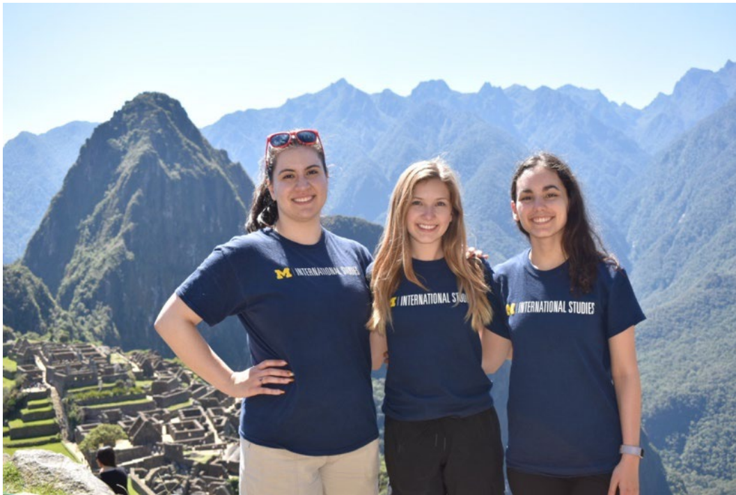
International Studies students on an abroad experience in Peru.