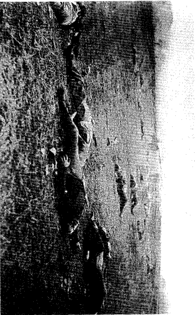
Fig 2.--Timothy H. O'Sullivan, Death on a Misty Morning .