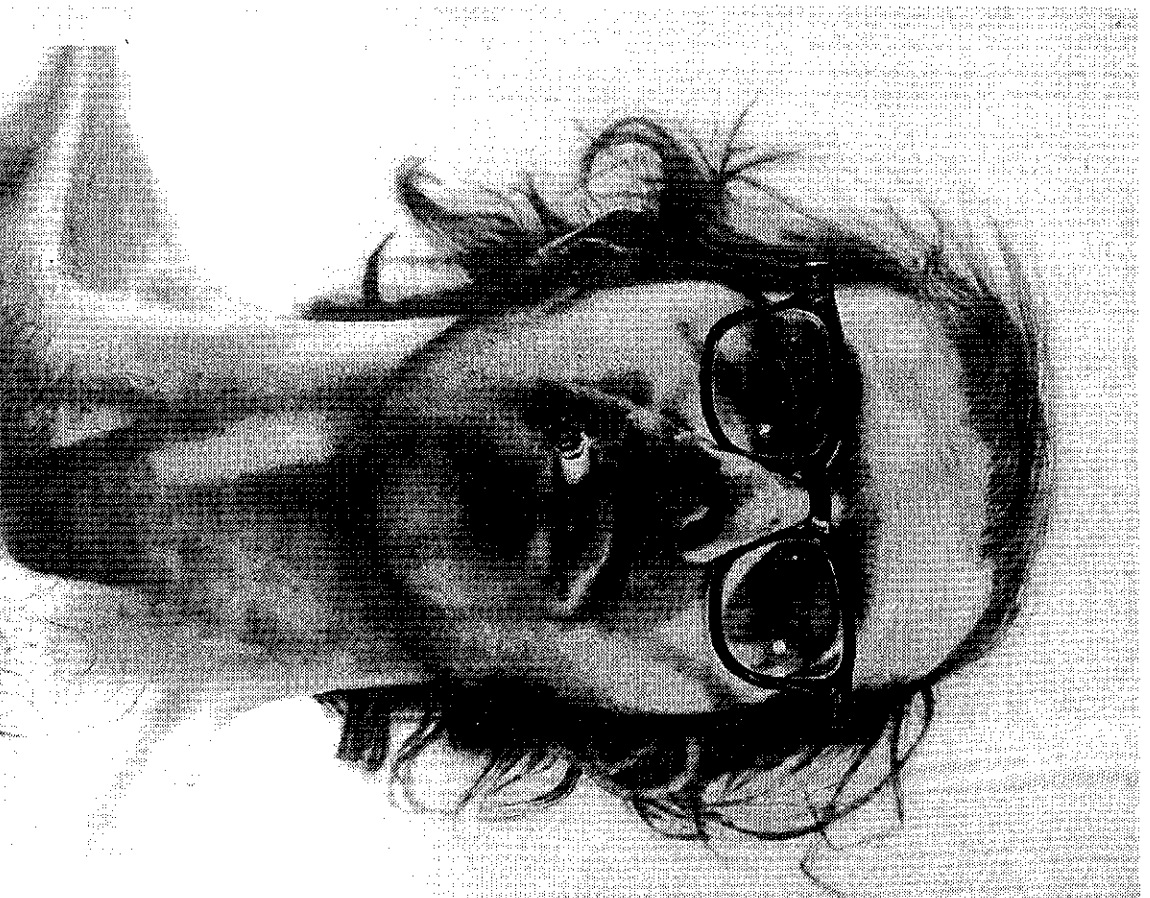
Fig. 3.--Chuck Close, Self-Portrait , acrylic on canvas, 1968. Collection, Walker Art Center, Minneapolis. Art Center Acquisition Fund.