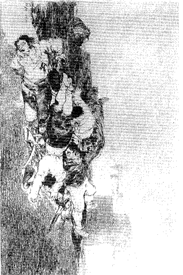
Fig. 1.--Francisco Goya, Tanto y mas [Even worse], from Los Desastres de la guerra [The disasters of war], etching, 1810-14.