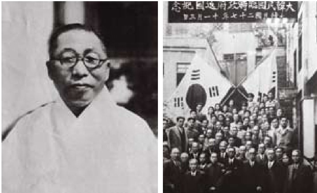
Kim Gu, President of the Provisional Government of Korea in Shanghai (left). High-ranking officials from Korea's Provisional Government in Shanghai pose for a commemorative photo in 1945 (right).

During the colonial period, Japan's economic exploitation of Korea continued. The lives of Koreans deteriorated under colonial rule until the end of World War II in 1945.