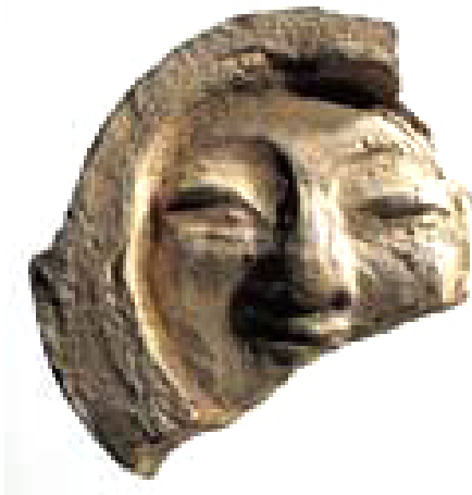
Inmyeon munui wadang

A roofing tile with added charm from Unified Silla