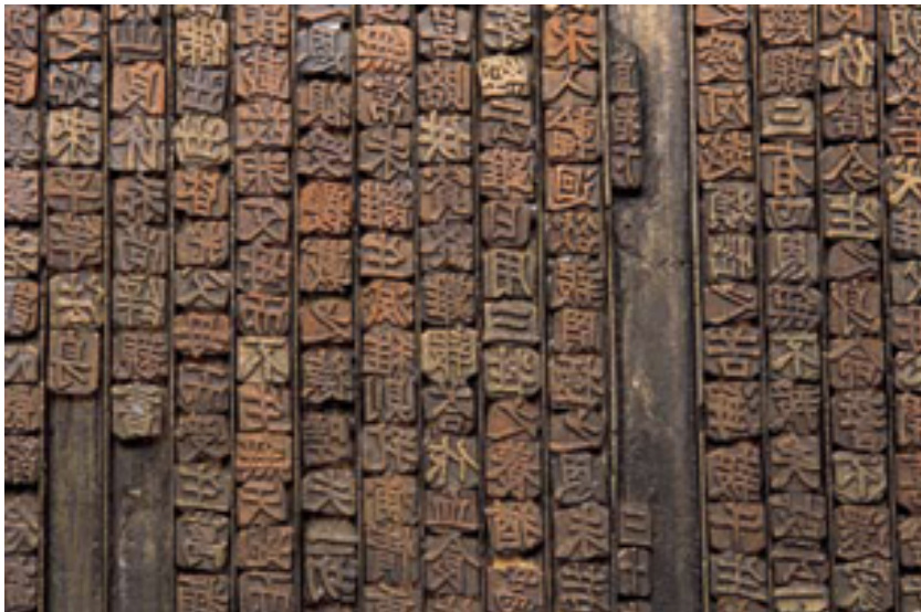
Restored metal movable type from the Goryeo era