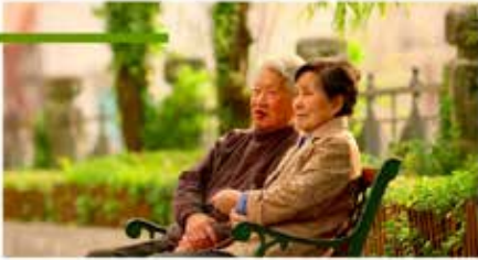
December 2 CHOP Film Series, "Please Remember Me"