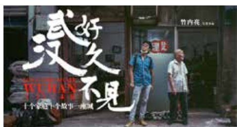
September 30 CHOP Film Series, "Long Time No See, Wuhan."