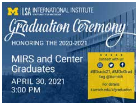
April 30 Graduation Ceremony