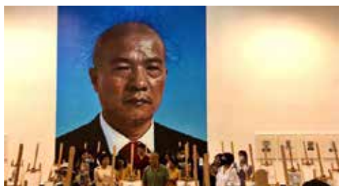
October 7 Special Arts Webinar, "Studio Visit and Conversation with Artist Wang Qingsong"