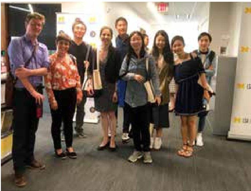
MIRS students with postdoc fellows

I remember in the prospective student virtual visit in March 2021, one student asked me what the experience was like being an LRCCS student. I told them without hesitation that accepting the offer from LRCCS was one of the best decisions I have ever made. Initially, I was really not sure where my interest lies, as everything looks fascinating to me, which makes it really hard for me to narrow down. Thanks for flexibility for course selection and expansive academic resources offered by LRCCS, I was allowed to take classes from a wide range of departments and eventually make up my mind to get on an academic track in political science. If it were not for the professional guidance and generous support offered by faculty, staff and students/alumni at LRCCS, I would not be able to find out what my strengths are and how to take advantage of them. After graduation, I will start my Ph.D. at Tsinghua University, with a research focus in big data politics.