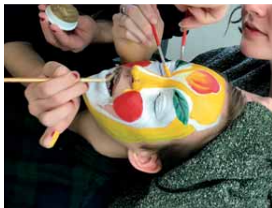
Outreach activity on the artistry of painted faces as seen in Chinese opera performance and interpreted by students.

Programming includes educator workshops offered through the World History and Literary Initiative (WHaLi) and East Asia K-12 Teacher Workshops ; collaborations with the Midwest Institute for International/Intercultural Education (MIIE) , a consortium of 100 two-year colleges; language support at Washtenaw Community College (WCC) ; library travel grants for researchers and educators; the development of an East Asia Language Teacher Certification program in partnership with the U-M School of Education; support of teaching workshops through area studies experts for faculty and students at University of Puerto Rico (UPR) ; and professional development opportunities for masters students.