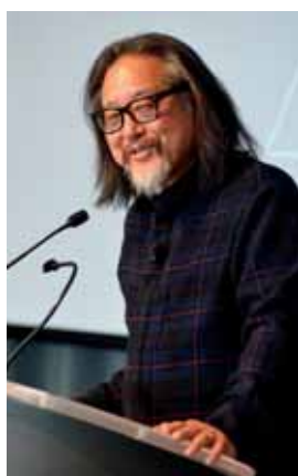
Stan Lai delivering lecture on creativity at U-M Weiser Hall, March 28, 2019.