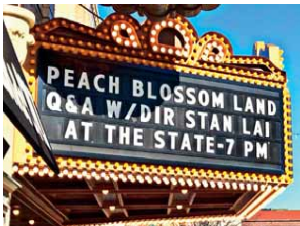
Film screening of Secret Love in Peach Blossom Land with playwright/director, Stan Lai.