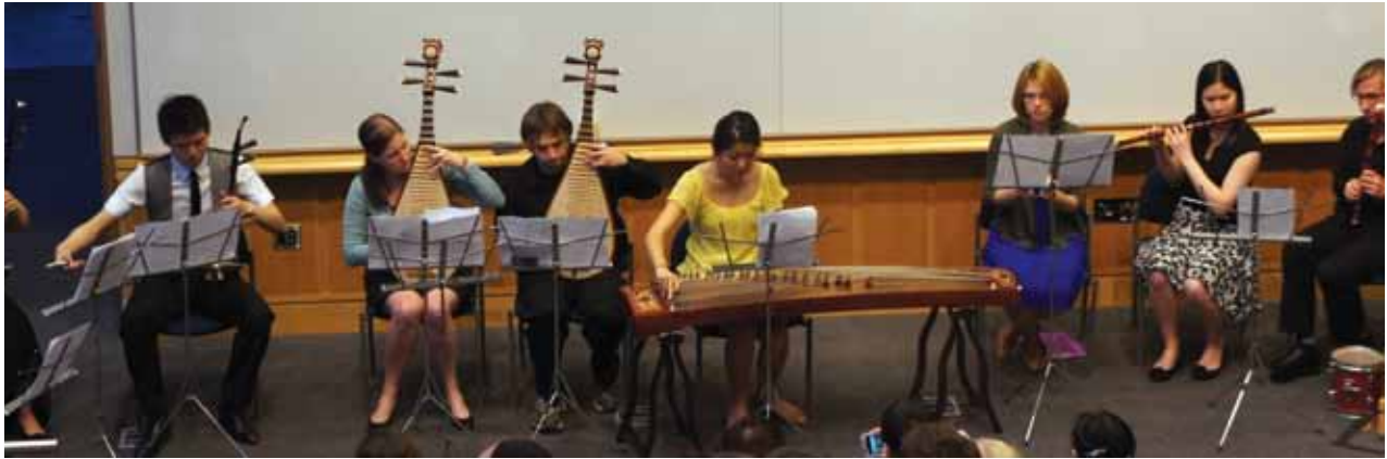
Residential College students play Chinese instruments at end-of-semester recital.