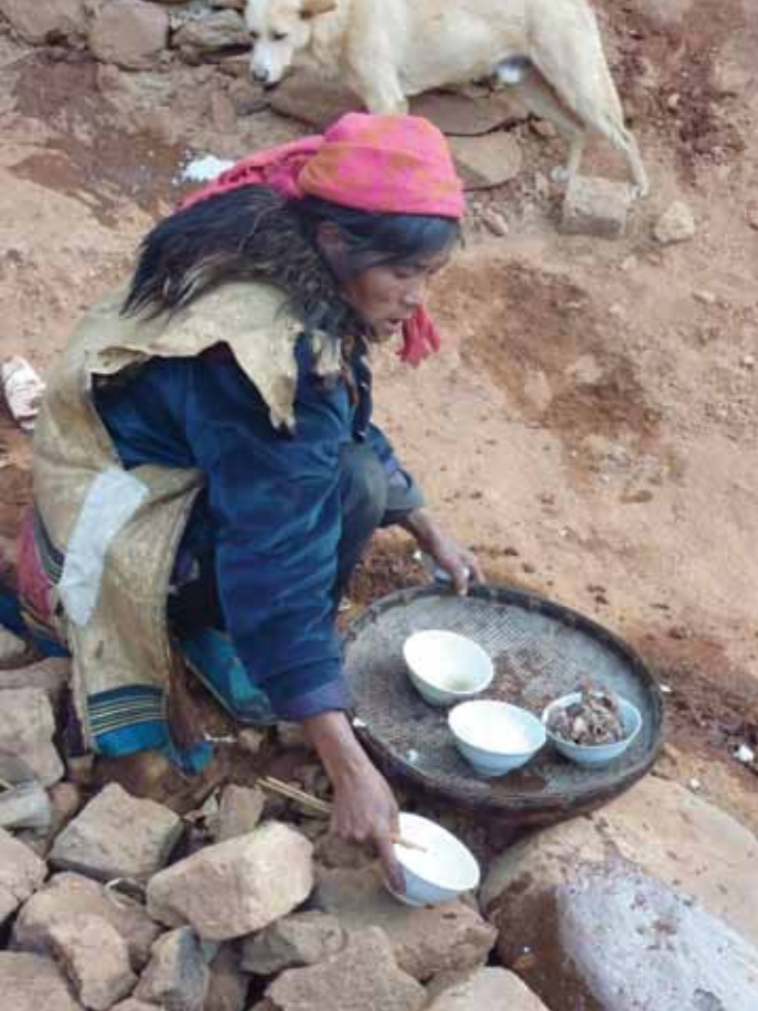
A woman at a funeral making a small offering to her mother who died many years before.