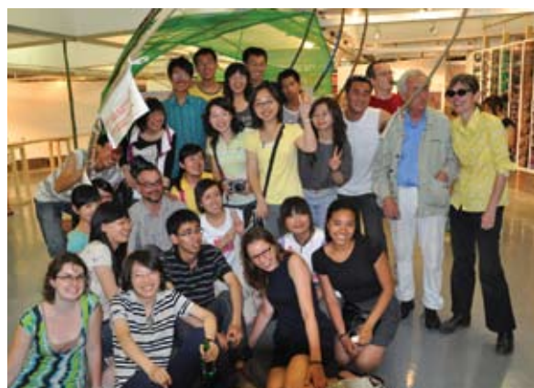
Top Photo: Tianjin University School of Architecture Exhibition, Extreme Urban Euphoria: Architecture in the Compression of Developmental Time Lower: Exhibit Installation Team Group Photo