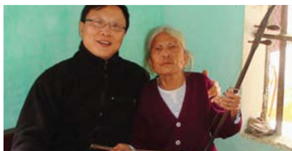
Bright Sheng in Vietnam

and co-commissioned by several prominent U.S. orchestras. Additionally, he completed a thirty-minute ballet score for the New York City Ballet that will be choreographed by Peter Martins and is scheduled to premiere in the 2010-11 season. Bright also has had three orchestral recordings released in 2009, two on Naxos— Spring Dreams and Phoenix —and a third one on Telarc Records featuring his first ballet The Nightingale and Rose , among others. Podcasts of Phoenix and Spring Dreams can be found at: http://blog.naxos.com/2009/05/05/podcast-the-phoenix and http://blog.naxos.com/2009/01/27/podcast-introducing-bright-sheng/ . During 2009-10, his compositions will be performed by both the St. Louis Symphony and the Richmond Symphony Orchestra in November, and Phoenix will be performed by the Philadelphia Orchestra in May 2010. In October 2009, he will guest conduct the Des Moines Symphony in Iowa with a program of his own compositions and those of Shostakovich.