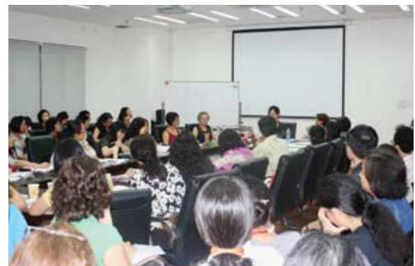
Top Photo: U-M-Fudan Conference Panel Lower: U-M-Fudan Conference Audience