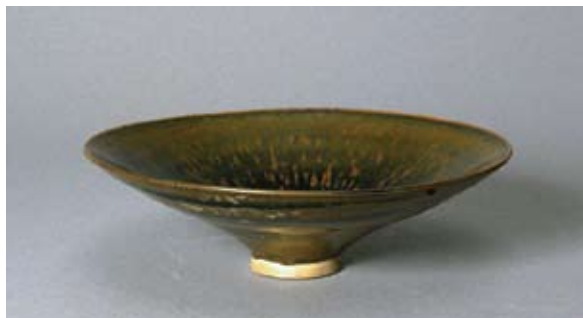
Ding ware tea bowl with streaky glaze - China, Song period (960-1279) 12th century - Stoneware with buff white body and dark glaze - Museum purchase for the James Marshall Plumer Collection, 1964/2.77