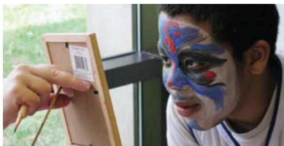
China Quiz Bowl

Rights—in Chinese: Eighteen teams from eight area middle and high schools throughout Metro Detroit came together to take part in a Chinese language competition co-sponsored by the University of Michigan Center for Chinese Studies, the Confucius Institute at Wayne State University, and Madonna University on April 25, 2009. The competition tested participants' knowledge in Chinese language and culture. Also featured was an immersion obstacle course where students communicated exclusively in Chinese at various simulated locations such as a bank, hotel, and convenience store. Students and coaches were treated to a lion dance, Peking Opera-style face painting, and a Chinese yoyo team, thanks to the Michigan Chinese Association of Ann Arbor.