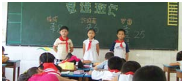
Please Vote for Me ( Nov. 14 at 7:00pm)