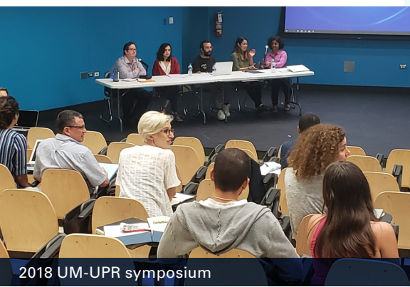
2018 UM-UPR symposium