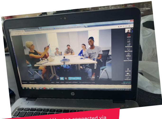
Ann Arbor and Havana connected via videoconference technology