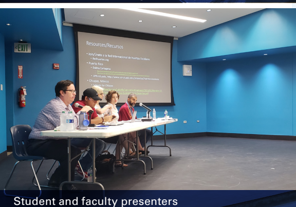
Student and faculty presenters