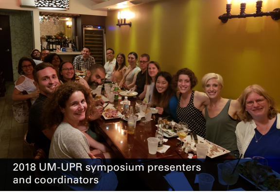
2018 UM-UPR symposium presenters and coordinators