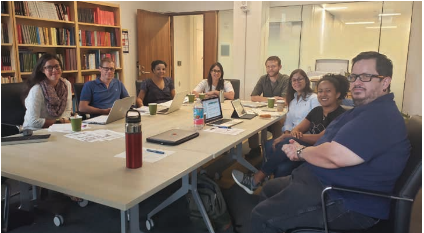
LACS AND OTHER U-M FACULTY AND STAFF MEET WITH VISITORS FROM THE UNIVERSITY OF PUERTO RICO TO DISCUSS THE U-M/UPR COLLABORATION IN AUGUST 2019.