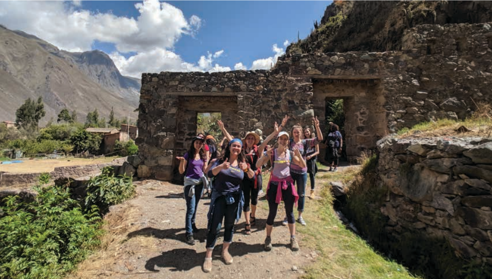
UM STUDENTS STANDING BY ORIGINAL INCA ENTRANCE TO OLLANTAYTAMBO (CUSCO, PERU).