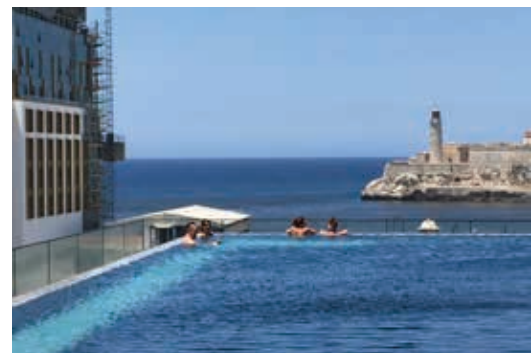
INFINITY POOL ON THE ROOF OF A NEW LUXURY HOTEL OVERLOOKING THE MALECÓN. PHOTO BY RUTH BEHAR, 2019.