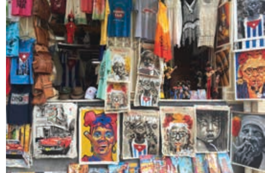
SOUVENIR STALLS IN OLD HAVANA CATERING TO THE BOOMING TOURIST INDUSTRY.