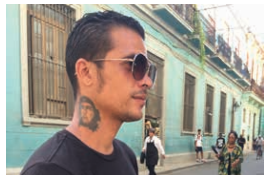
A WORKER IN THE TOURIST INDUSTRY SEEKING RESTAURANT PATRONS, WITH CHE GUEVARA TATTOO. PHOTO BY RUTH BEHAR, 2019.