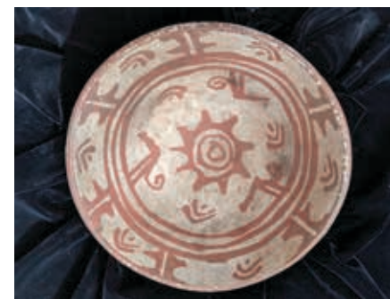
PAINTED BOWL (CA. AD 1000) DISCOVERED BY ARCHAEOLOGIST HOWARD TSAI AND HIS TEAM AT THE SITE OF LAS VARAS, PERU.

In this article ( doi.org/10.1080/00776297.2019.1581452 ) Tsai presents evidence collected from his 18-month archaeological fieldwork conducted in Las Varas, Peru, to identify the source of a much-debated style of prehispanic pottery. 3D models of artifacts mentioned in the publication can be found on LACS's SketchFab online database: sketchfab.com/umichlacs .