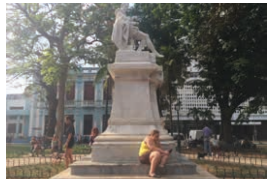
INTERNET IS MORE AND MORE COMMON IN CUBA TODAY WITH GOVERNMENT-INSTALLED WIFI HOTSPOTS IN PUBLIC PARKS. FOR SOME CUBANS WITH FINANCIAL MEANS OR A STEADY SOURCE OF FAMILIAL REMITTANCES FROM ABROAD, EVEN SMART PHONES CAN ACCESS THE INTERNET. PHOTO BY RUTH BEHAR, 2019.