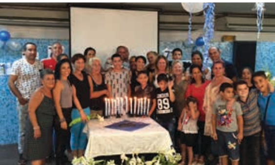
BAR MITZVAH IN HAVANA, CUBA. PHOTO BY RUTH BEHAR, 2019.

On this visit I noted the expansion of the Internet on the island. It is common now to see people sitting in public parks, where there are WiFi hotspots installed by the government, connected to