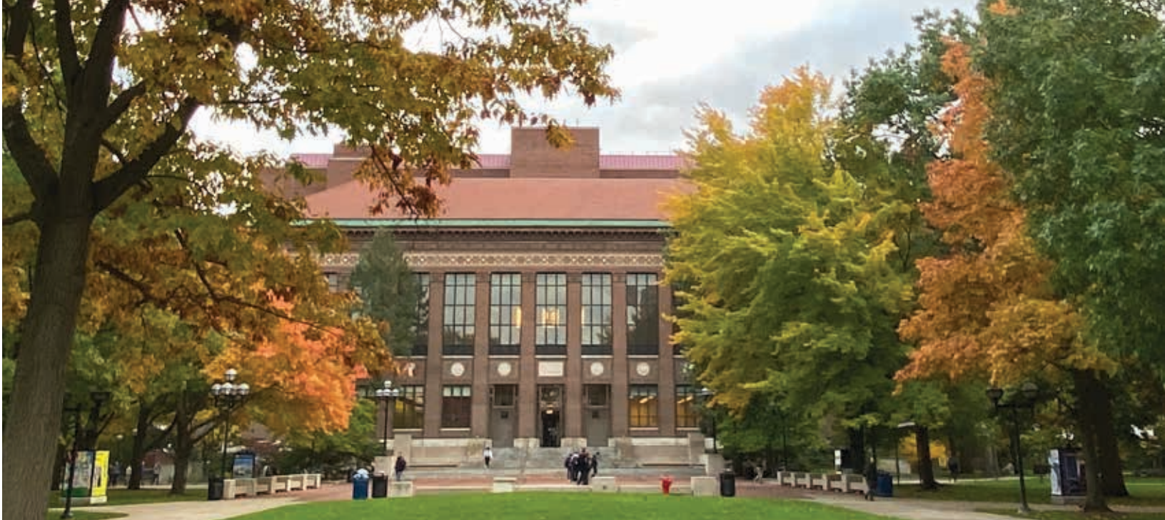
THE HATCHER GRADUATE LIBRARY ON THE CENTRAL CAMPUS OF THE UNIVERSITY OF MICHIGAN IN ANN ARBOR, MICHIGAN.