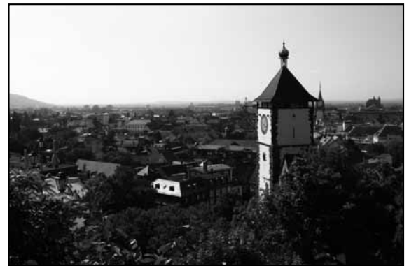
Two views of Freiburg

dorm has probably presented the most amount of change. Living and sharing a flat with seven roommates from around the world I have been able to experience an array of cultures right at home and the feeling of community has been a great comfort. One of my best experiences so far was attending the 200th anniversary of Oktoberfest in München. Not really knowing what to expect, the hundreds of thousands of people at Oktoberfest was almost incomprehensible, however, singing "Sweet Caroline" in a Bierzelt with hundreds of others was truly a once in a lifetime experience. Although Oktoberfest has been my most memorable experience, the little aspects of life here in Germany have been just as rewarding. Whether it's cooking dinner with roommates and discussing the environment and differences in school systems around the world; or being mistaken for a German and being asked for directions (which I am happy to say has happened three times already); or if it's a simple German movie night with friends—all of these experiences I know are going to define my year abroad and help to make this experience truly unique. My first few weeks here in Freiburg have been filled with new friends and exciting adventures and with classes at the University starting soon I know that the best is yet to come.