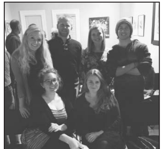
Swedish students at the Signe Karlström Concert at Kerrytown Concert House