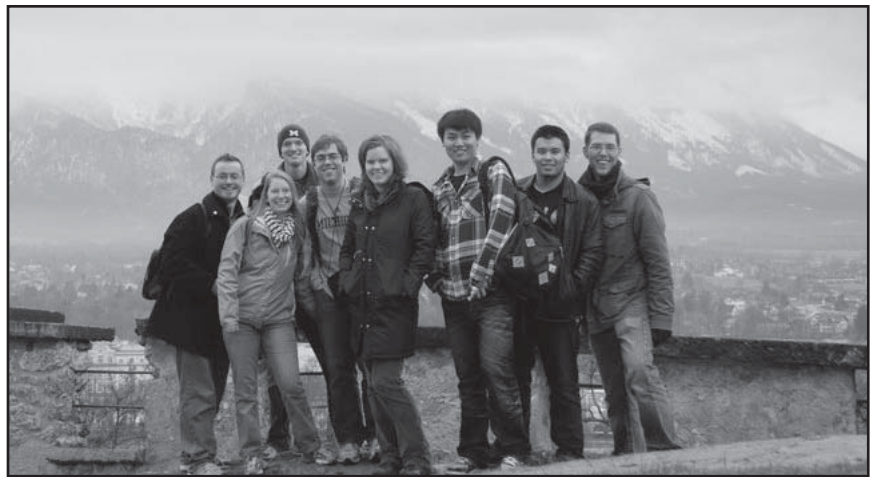
Max Kade Residents, Munich Trip 2011

Max Kade House residents spend fall semester and the first half of winter semester preparing for the annual trip to a German-speaking city. This year the group will travel to Cologne for the first time. In the fall, students learn experientially what goes into preparing for a week-long trip abroad and exactly how to find the information they need. In the winter, students will continue planning