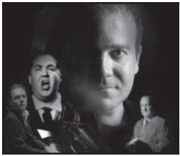
The Swedish trio gave seven concerts in their U.S. tour, including Ann Arbor, New York City, Washington D.C., Philadelphia, Chicago and San Francisco.

The Scandinavian Program's Annual Signe Karlström Event commemorated the centennial birthday of beloved Swedish tenor Jussi Björling. Jussi Björling's 100th birthday has been celebrated by more than 200 events throughout Sweden, Europe and the U.S. Jussi is recognized by many as one of opera's