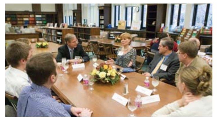
ELC members met with undergraduate and graduate students for informal discussions during their annual meeting in Ann Arbor. While some of the group settled at tables in Foster Library, other ELC members and students headed for Starbuck's on South University.

The ELC is the primary alumni service organization for the Department of Economics. As such, its members provide advice, financial support, and outreach opportunities that advance the long-term goals of the Department.