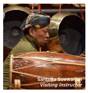
DECEMBER 12 AND MARCH 20 Gamelan Concerts

Presented by Nam Center for Korean Studies, co-sponsored by CSEAS