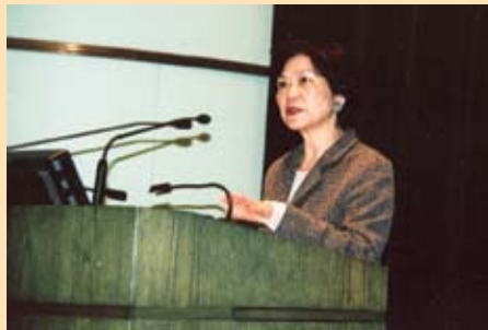
Chan Heng Chee, Ambassador of the Republic of Singapore to the United States

Chan Heng Chee , Ambassador of the Republic of Singapore to the United States, formerly Professor of Political Science at National University of Singapore, spoke on U.S.-ASEAN relations in February 2006. This event was co-sponsored with Singapore Students Association.