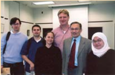
Datuk Seri Anwar Ibrahim, pictured with Graduate Students

Datuk Seri Anwar Ibrahim , Former Deputy Prime Minister of Malaysia and Distinguished, Visiting Professor, Georgetown University, gave a lecture in November 2005 on Human Rights and Politics: An Asian Perspective. The event was cosponsored by the Center for International and Comparative Studies, Institute for the Humanities, International Institute, U-M Law School, and Gerald R. Ford School of Public Policy.