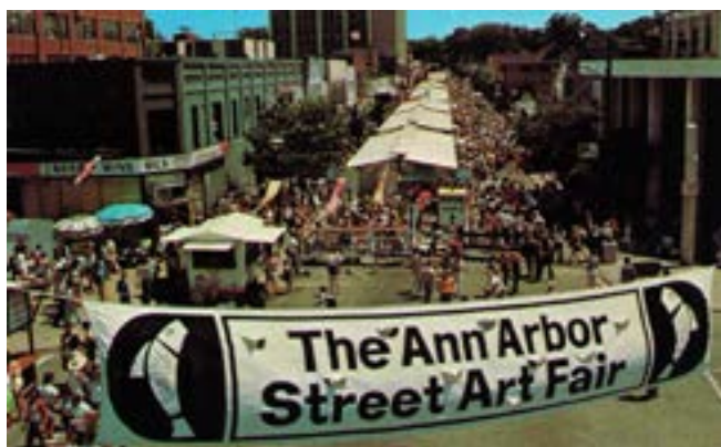
Ann Arbor in the 1970s.

Sahas Bunditkul (PhD, Engineering, 1978) remembers Ann Arbor from the 1970s. After receiving a PhD in Mechanical Engineering from U-M and then an MBA from the University of Leeds, he returned to Thailand. Sahas is now the Chairman of the Executive Committee and a member of the Board of Trustees of the Asian Institute of Technology and an Executive Board Member of the Research Institute of Thailand after serving as Deputy Prime Minister and Interim Foreign Minister of Thailand in 2008. Though now retired, he often gives lectures overseas on the subjects of strategic logistics and disaster management.