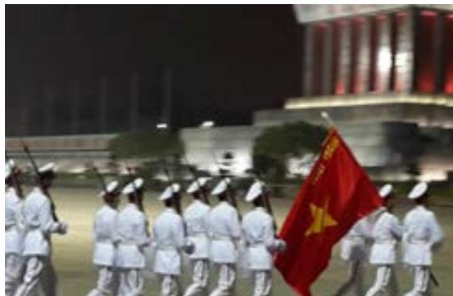
Lang Bac Ho, Ha Noi.