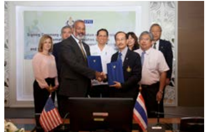
Signing of the Memorandum of Understanding

While in Thailand, the group met a traditional healer, explored the university, and found time for fun.