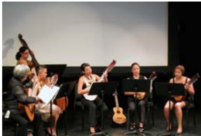
Performing at Keene Theater, Residential College, July 26