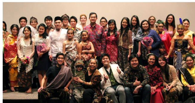
Indonesian Cultural Night performers, February 2014