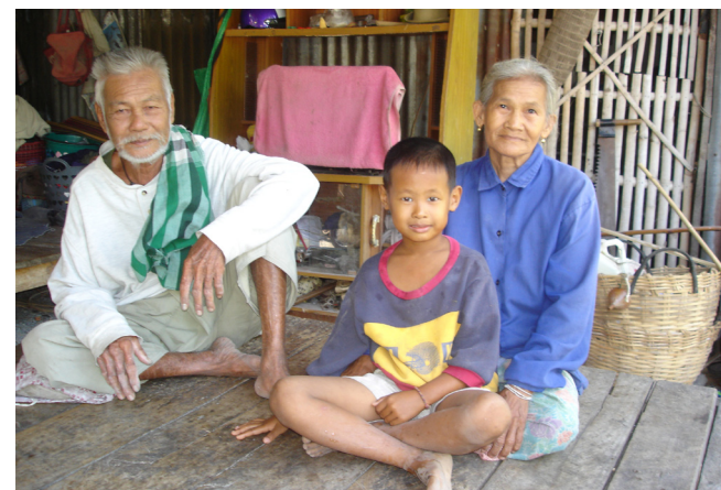
An example of a skipped generation household

for caregiving grandparents. This research will contribute to the discipline of social work by enhancing our understanding of family relationships in later life. Consistent with emerging perspectives in gerontology that call attention to “successful “ and “productive” aging, this research underscores how older adults in Thailand are actively engaged in trying to improve the lives of their families.