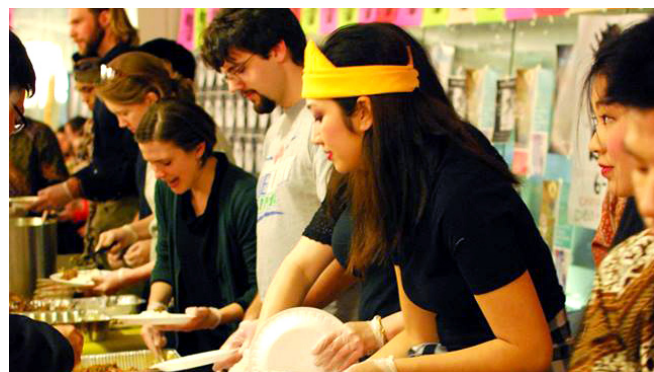
Serving food at the Indonesian Cultural Night