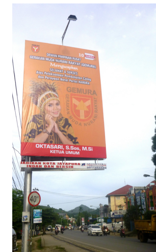
Indonesian political candidate wearing West Papuan headdress, Jayapura

I also spoke with numerous West Papuans about their experiences. I talked with human rights lawyers and investigators working with political prisoners and the