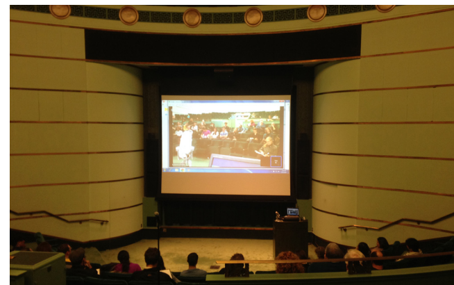
Anonymous via videoconference; Rackham Amphitheater

We also had some special events, including a visit by a film producer, who must remain anonymous, connected to the distribution of the documentary film, The Act of Killing by Joshua Oppenheimer, as well as a public screening of that film at the Michigan Theater. The producer was able to connect us to the Indonesian director of the film, Anonymous, who video-conferenced in to Rackham Amphitheater. To let Anonymous view us, and protect anonymity, we turned the camera back on ourselves.