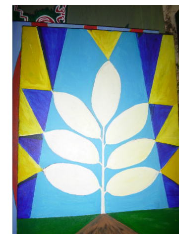
Artwork by Donatus Moiwend, contemporary artist, Papua.

Walking across the border from Papua New Guinea, where I have worked for twenty-five years, to the Indonesian territory of Papua, where I was visiting for the first time, presented me with a study in contrasts. On one side of the border, people lived in raised wooden houses with thatched roofs, worshipped in Christian churches, raised bananas, harvested sago, and let their pigs run wild in the bush. On the other side, people lived in stone houses with tile roofs, the modin announced the call to prayer, and people built rice paddies and fish ponds, and kept Indonesian cattle by the side of the house. The roadside restaurants served Padang food, including nasi goreng and jackfruit curry. On clogged roads, individuals, couples, and even entire families, improbably perched atop tiny motorbikes, zipped around stalled cars and trucks.