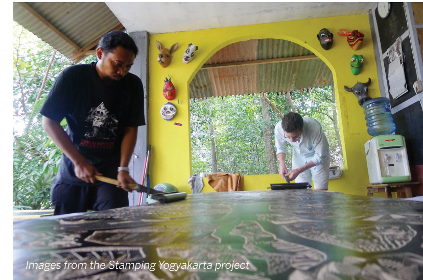
Images from the Stamping Yogyakarta project