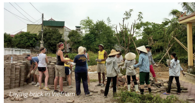
Laying brick in Vietnam