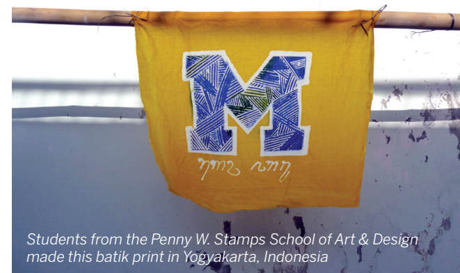
Students from the Penny W. Stamps School of Art & Design made this batik print in Yogyakarta, Indonesia