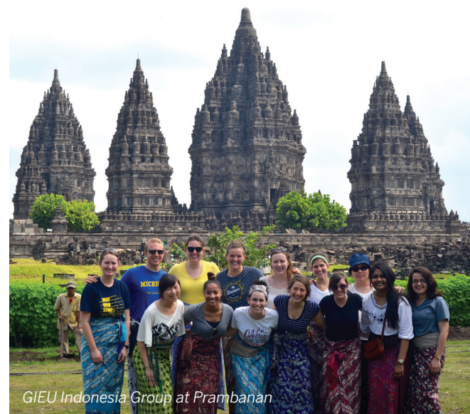
GIEU Indonesia Group at Prambanan