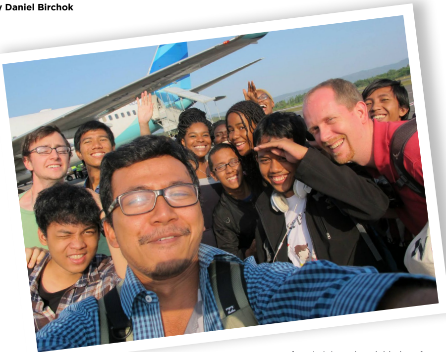
USIPP 2015 on the tarmac in Yogyakarta

founded through an initiative of the U.S. and Indonesian governments, funded by the Henry Luce Foundation, and has been jointly administered for the past five years by Lehigh University's Office of International Students and Scholars and the University of Michigan's Center for Southeast Asian Studies. One of its essential features is that it is a multidirectional exchange, bringing students from the U.S. and Indonesia together for three weeks in each country to jointly study the theme of "democracy and religious pluralism." In total, USIPP involves twelve undergraduates, two each from three