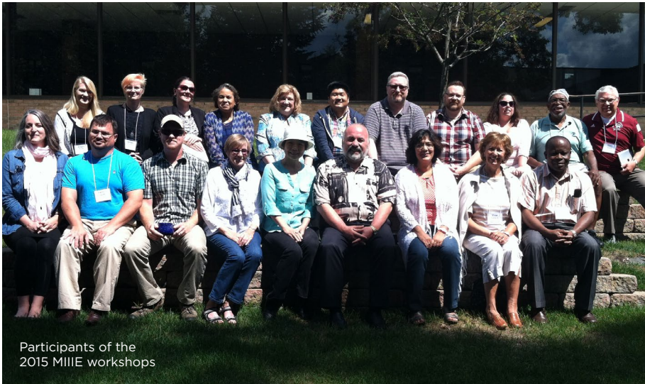
Participants of the 2015 MIIE workshops

T he U-M Center for Southeast Asian Studies has been a strong partner since 2008 in providing support to community college faculty in the Midwest Institute for International/Intercultural Education (MIIE) consortium.