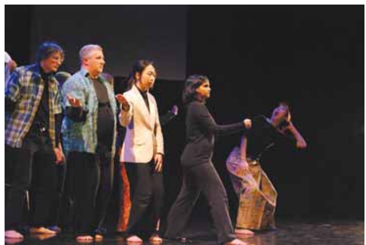
Actors in performance.