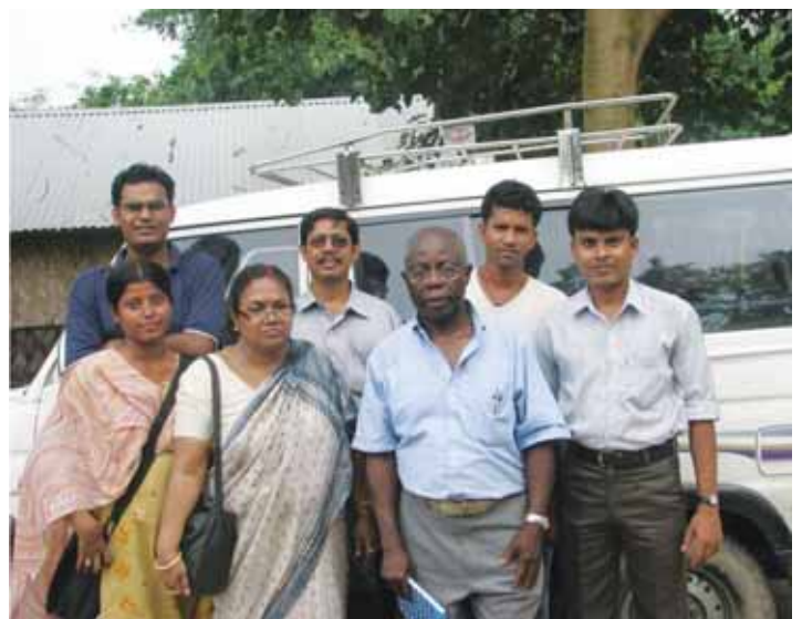
Figure 2: Dr. Nriagu with his collaborators in Calcutta.

The collaboration serves to enhance local research skills. Some members of the research team in India are shown in Figure 2; the picture was taken when Dr. Nriagu visited the study site in August, 2008.