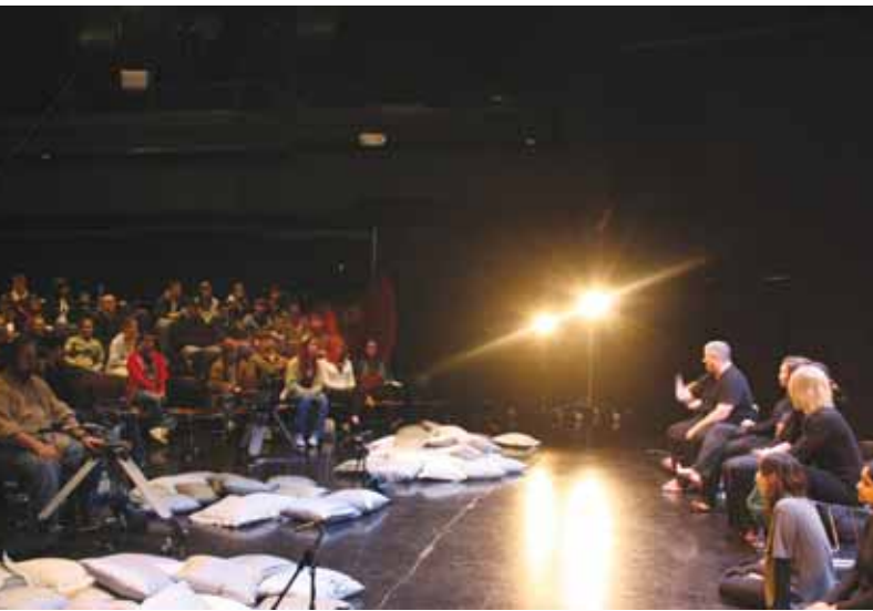
Hartland High School students interacting with the cast post-performance.