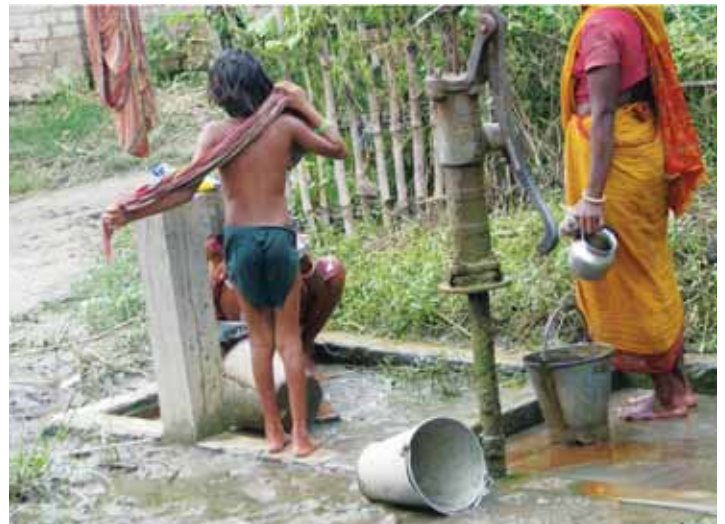
Figure 1: Example of tube well contaminated with arsenic.