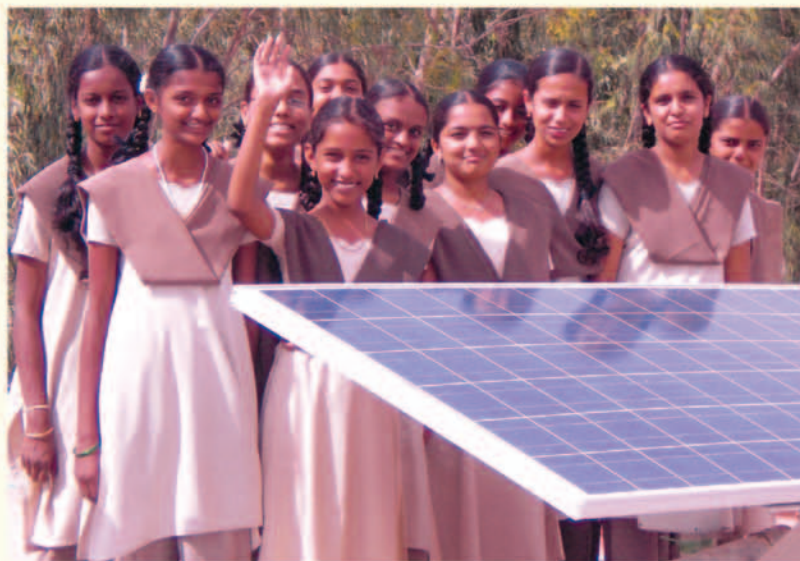
Girls Around Solar Panel

During July and August, I collaborated with members in the village of Pavagada to install a solar powered backup system to power a new computer lab at Jnana Bodhini School. Throughout the two months I was there, I worked closely with community members, including my uncle who is a local electrical contractor in Pavagada, to develop a design, find a supplier, and coordinate the transportation and installation of the system. The $1,400 solar powered battery back up system they installed supplies enough power to drive the three computers for almost five hours when normal grid power fails, and on August 12th, they were treated to the "Welcome" screens of the three newly installed and solar powered computers for the first time.