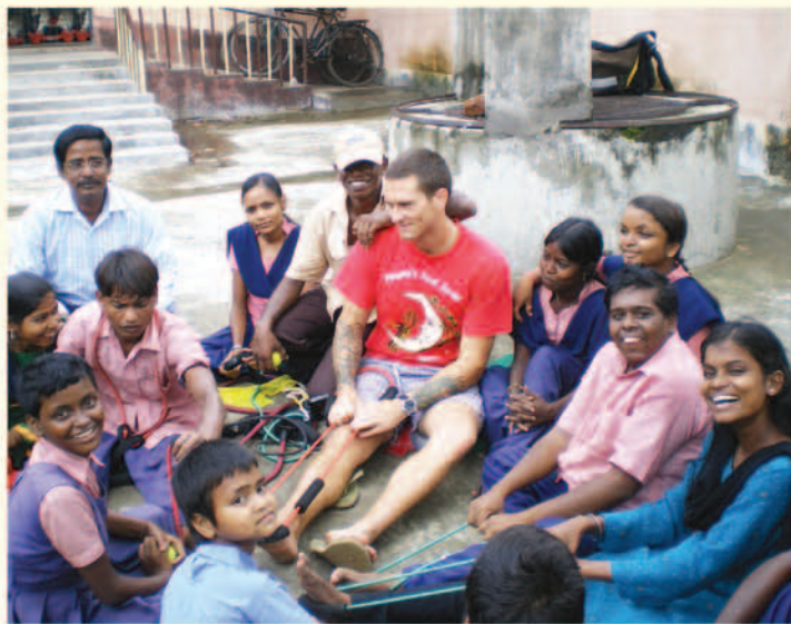
Working with children with polio and congenital birth defects.

activities and the education of available staff. I was deeply touched and hope to return soon and continue to be of service.