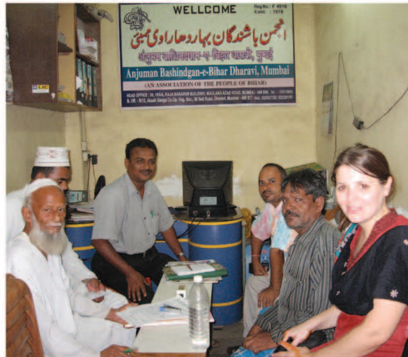
Bashindgan-e-Bihar Office, Dharavi, Mumbai.

With the support of a summer grant from the Trehan India Initiative Theme Year, I have been engaged in a historical research project that contributes towards my larger dissertation research. This historical and ethnographic project examines the ways in which non-state actors working in partnership with the Government of India mobilized the handicraft and handloom industries in development planning during the early years of independence. In particular, I have focused on the programming and ideological discourse of the Ford Foundation as a uniquely positioned non-state player during the 1950s and 1960s. Having opened its first office outside of the United States in New Delhi in 1952, the Ford Foundation served as both a grant-making organization and an implementing agency during its first two decades of operation in India. The handicraft and handloom projects undertaken by the Ford Foundation during this period