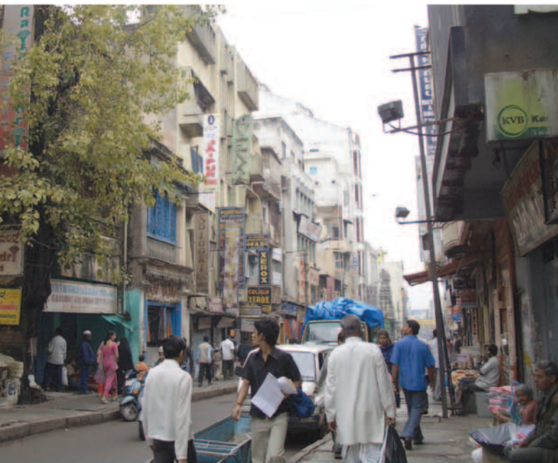
Avenue Road in Bangalore.

My proposed research examines the conceptualization and contestations of urban space in the public realm by different social groups in Bangalore, India. The contemporary Indian city is transforming rapidly as the state undertakes large urban renewal projects to “modernize”. There is little or no engagement of city dwellers that are affected by these renewal projects or the master planning process. These planning processes particularly challenge the nature of public space which in its normative definition enables civic engagement in city life. As these changes occur, city dwellers re-negotiate the meaning and relevance of the space in their everyday lives. I want to understand how public space is conceptualized by different social groups and also examine the dynamics of civic engagement in urban planning processes. My research explores linkages between concepts of urban planning, citizenship and democracy in the contemporary Indian city.