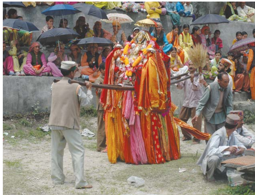
A goddess ritual from Himachal Pradesh.

tion of the deity, in a village ceremony in the Kullu-Shimla area, in which the deity is carried about and ritually given a new mask, shaken, and subjected to a priest's incantations while away from the temple. Second, I observed transformation of the religious specialist, in which mediums go into trance at semi-annual devotional gatherings for the "naga" (serpent) deity, ritually flagellating themselves with chains, and channeling the voice of the deity on matters