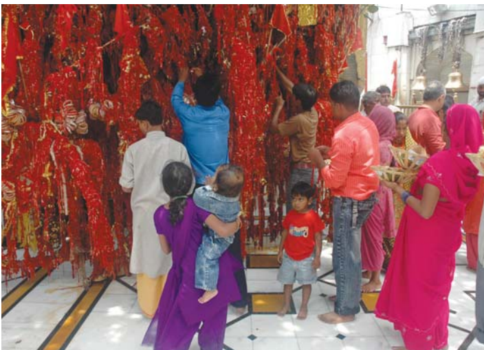
A "wishing tree" festooned with strings at a goddess shrine in Himachal Pradesh.

The Indian segment was accomplished with a summer research grant from my academic department. I visited pilgrimage shrines in north-western India to acquire Hindi-language devotional literature. What I ascertained is that literature from these sites tends to emphasize personal transformation through step-by-step instruction, through austerities, vow-keeping, devotion, and so forth. However, I observed that the most popular instructional material