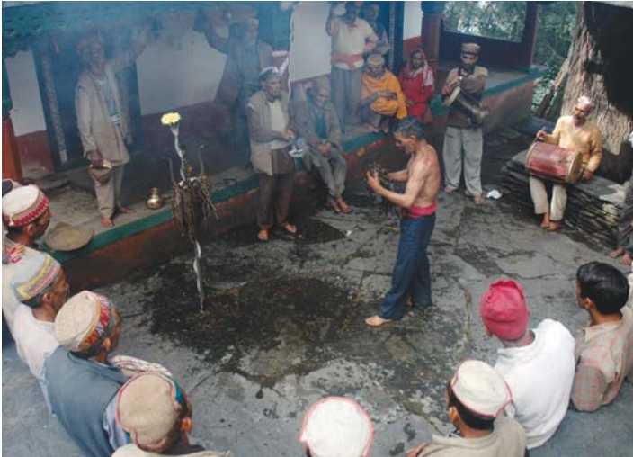
A transformation ritual from Himachal Pradesh in the Himalayas.