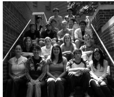
2008 REU students from the domestic and China exchange program.