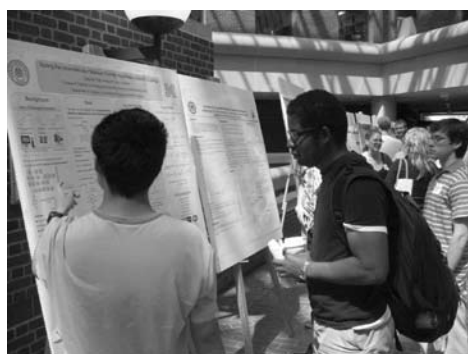
A total of 68 posters, divided between two sessions, were on display in the lower atrium of the chemistry building.