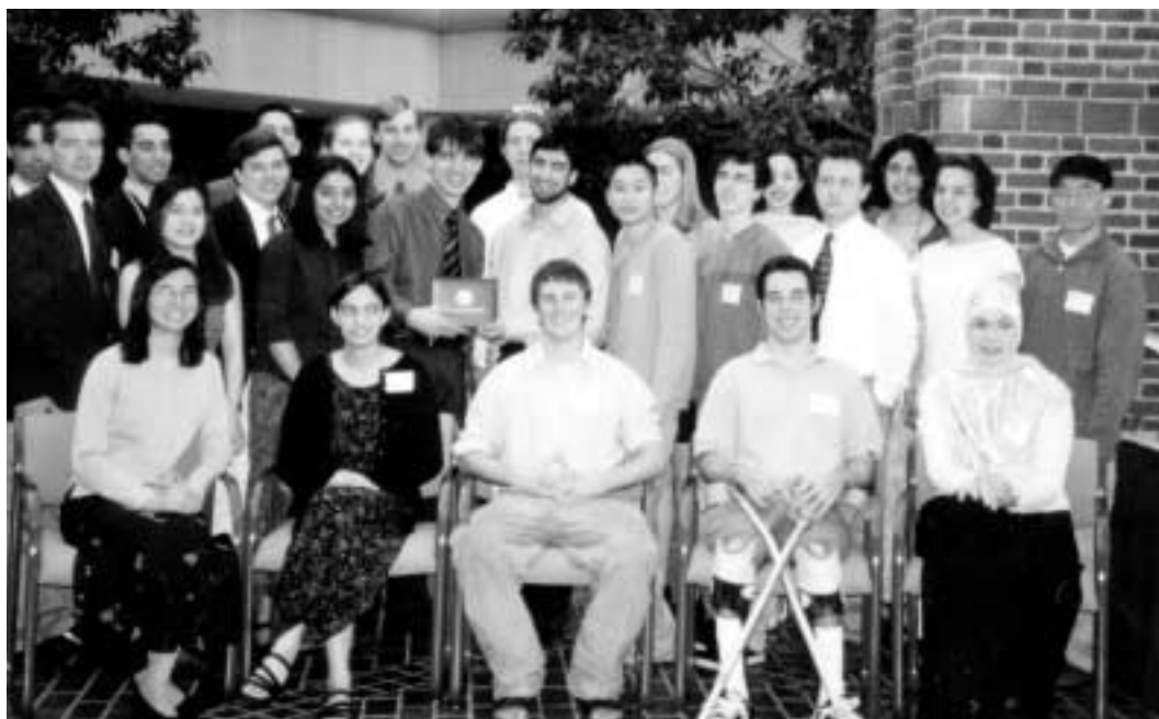
Undergraduate Graduation Reception, April 27, 2001