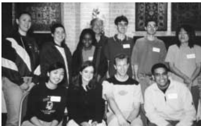
2001 REU Welcome luncheon

The National Science Foundation creates research opportunities for undergraduates to join research projects each summer. One of the principle vehicles of NSF support for such projects is through the Research Experience for Undergraduates (REU) program.