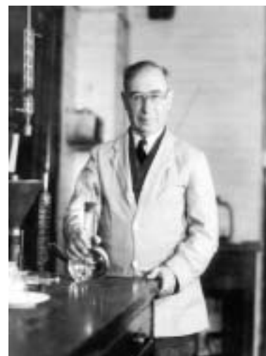
Moses Gomberg in the laboratory about 1935