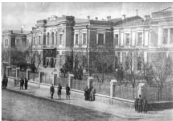
Boy's classical gymnasium in Elizavetsgrad, Russia, where Gomberg was a student in the 1880's. It has now been converted to an officer's club.