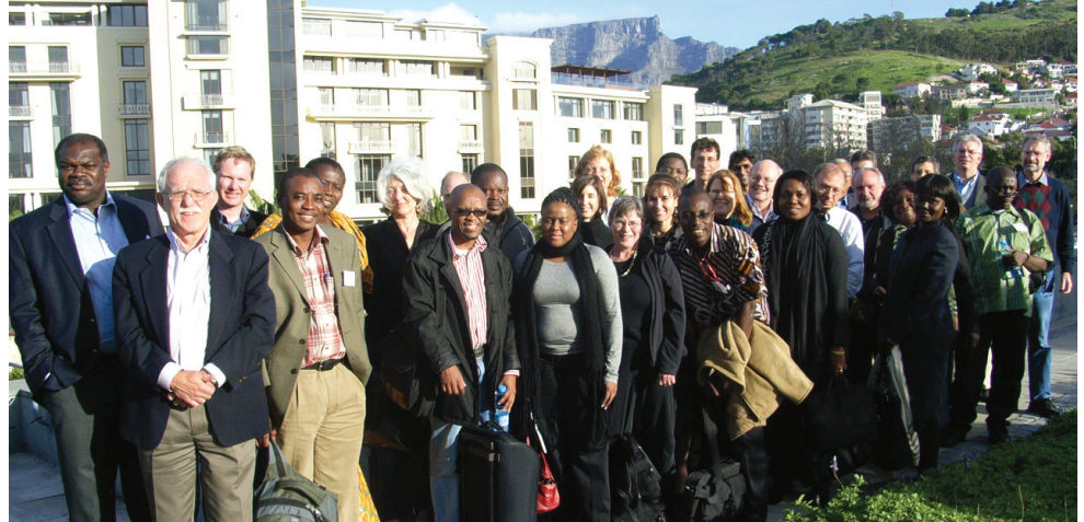
ASRI launch conference participants