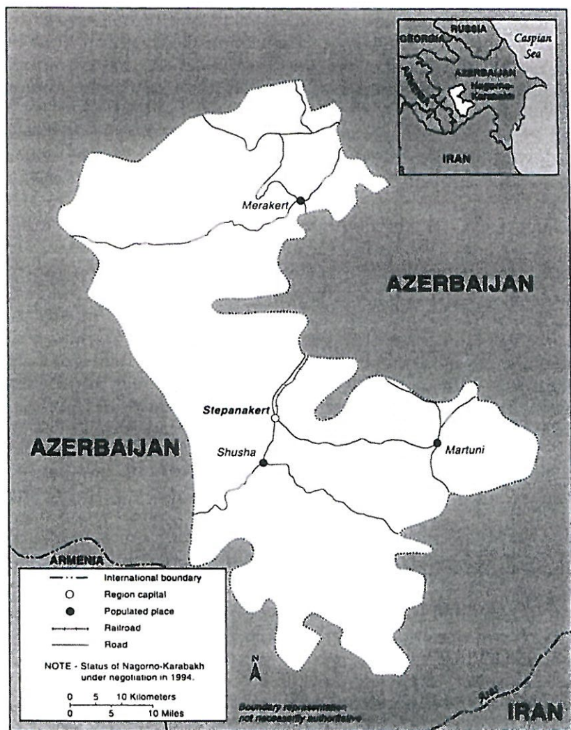
Figure 3. Nagorno Karabakh, 1994.