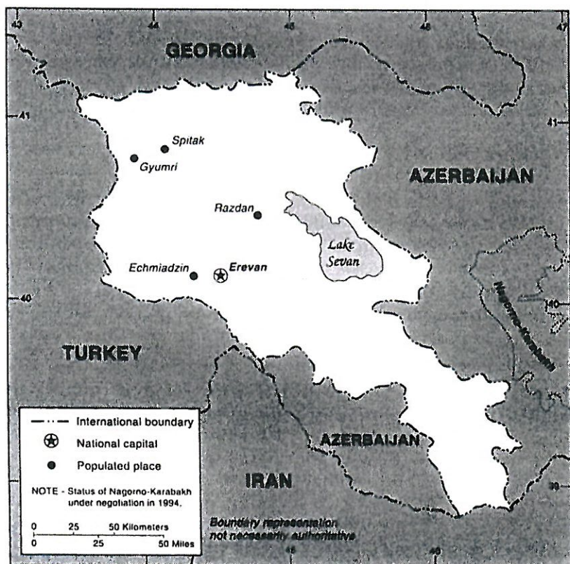
Figure 2. Republic of Armenia, 1994.